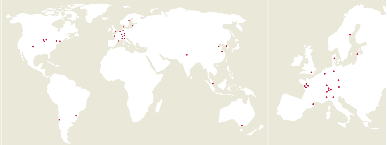
The current Bucher international locations.