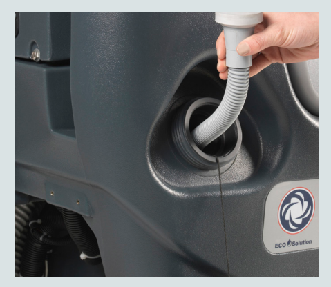
Standard on-board filling hose for simultaneous dump and refill