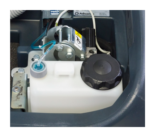
Ecoflex chemical kit (optional); easy to install and immediately accessible