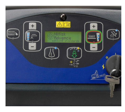
Easy to use control panel, with the Ecoflex button in central position

The exceptional Ecoflex system allows the operator to match the floor cleaning machine's performance to the soil on the floor and the required level of clean. When encountering more soiled areas of the floor, the operator can activate the "burst of power" button for extra cleaning performance, and as easily return to original settings for minimum usage of water, detergent and power. Green meets clean.