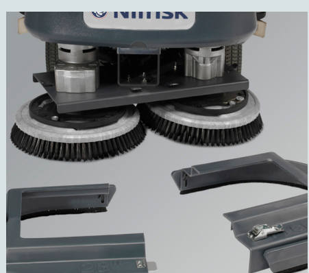
Thanks to the new removable deck covers concept, the scrub deck is immediately accessible