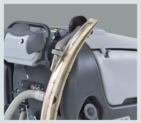
A built-in squeegee hanger makes transport easier through corridors/doorways