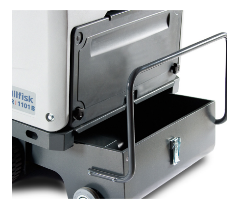
The hopper capacity is extremely large to extend operational time