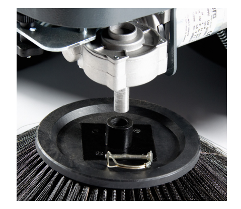
Nilfisk's famous no-tools concept allows fast and easy replacement of brushes and filter for minimal downtime